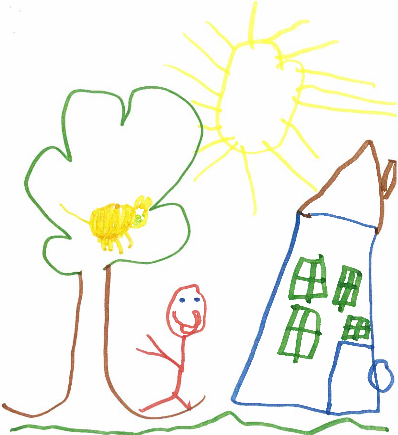
A woman found Teeny in her tree but she didn't know who he belonged to. She couldn't take him in her house because she was allergic to cats so she took him to her Aunt's house.